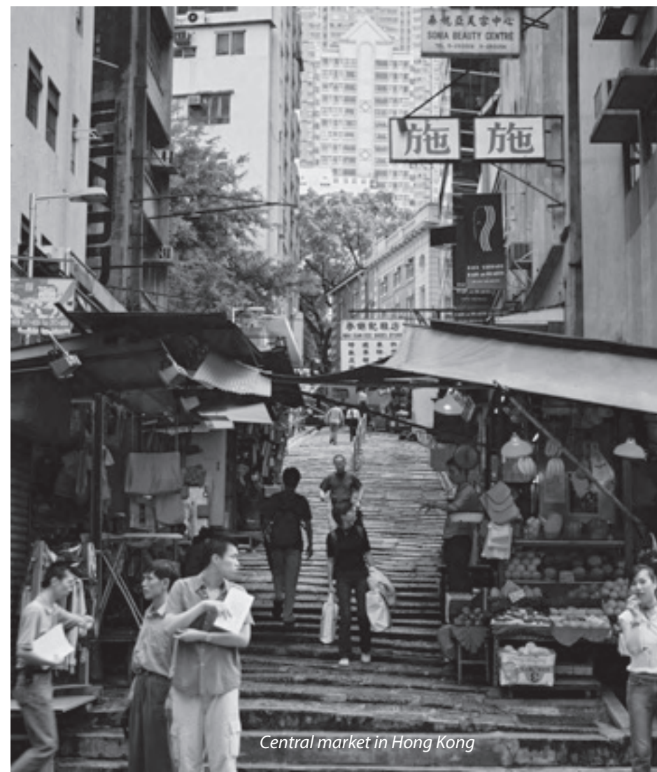
Central market in Hong Kong