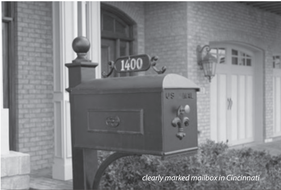
clearly marked mailbox in Cincinnati

Your address is the key to your castle. Matching the perfect house number with your personality, gives you the WOW factor. Knowing what your number means is the key to personal nirvana. This is not Feng Shui, it is numerology and it's powerful information. Addresses must be clearly marked and easily visible. If a visitor can't locate your address, neither can the universe and opportunities will pass you by. To figure out your house number, add up the numbers of your address until they reduce to a single digit.