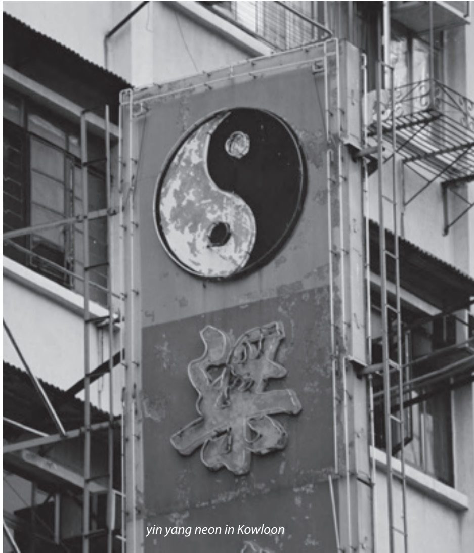
yin yang neon in Kowloon