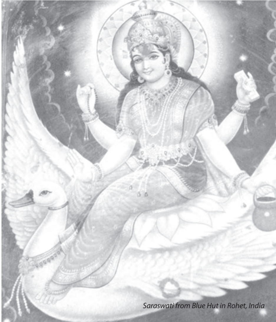
Saraswati from Blue Hut in Rohet, India