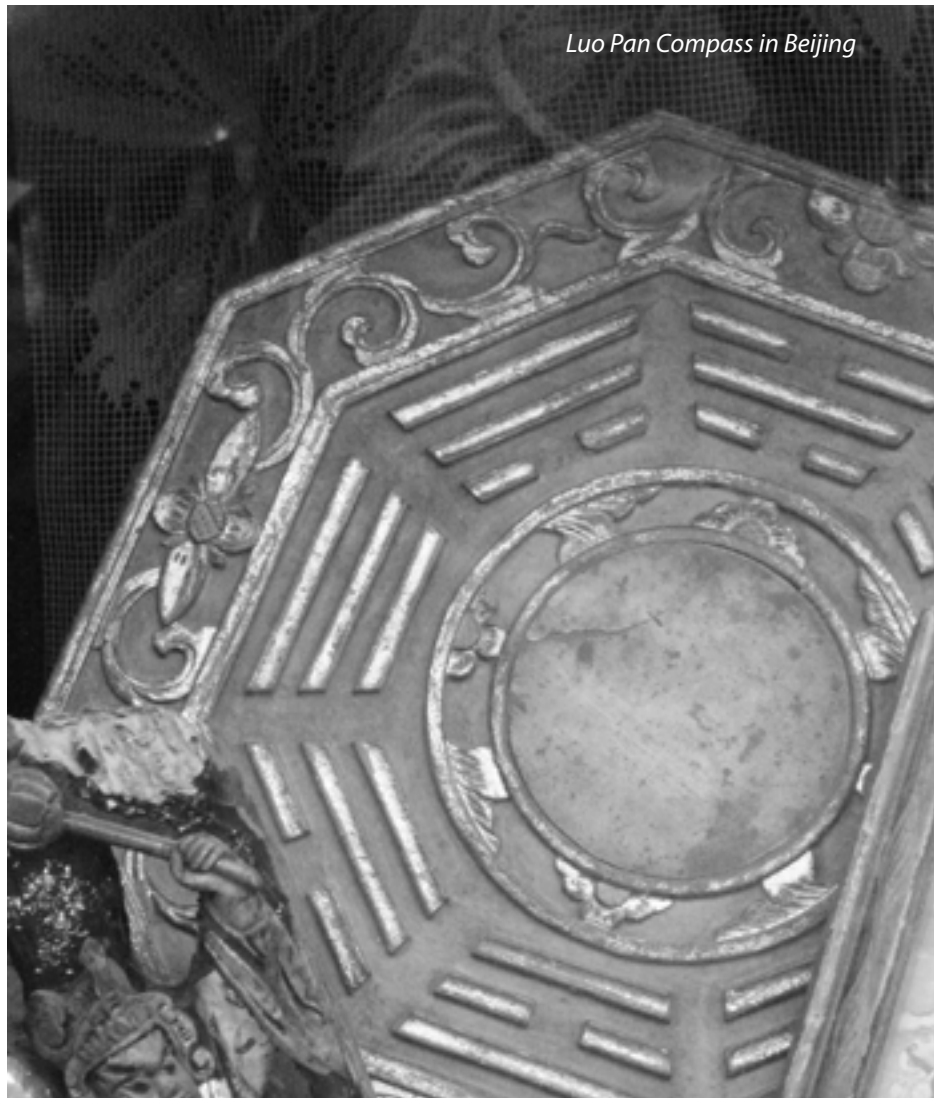
Luo Pan Compass in Beijing