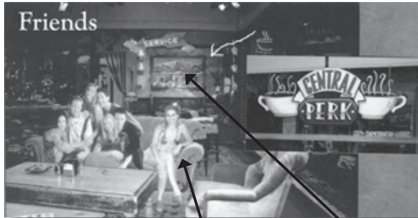
that's me with the cast of Friends and my painting in the background on the Central Perk set