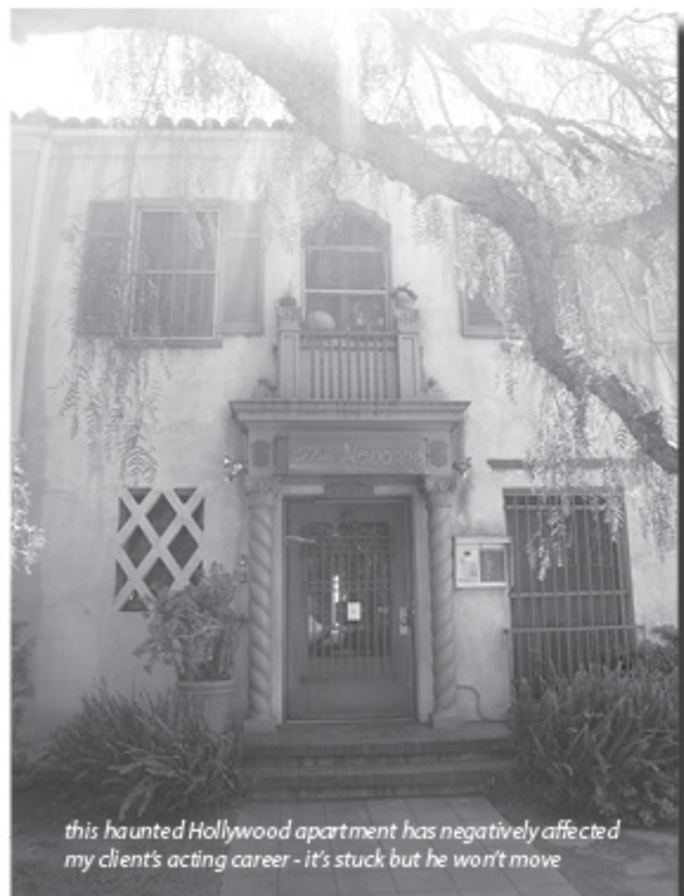
this haunted Hollywood apartment has negatively affected my client's acting career - it's stuck but he won't move