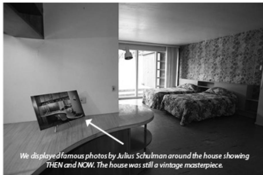
We displayed famous photos by Julius Schulman around the house showing THEN and NOW. The house was still a vintage masterpiece.

The house was basically empty and no one had lived in it for awhile. I did energy work lighting special incense and ringing my Balinese Bell to invite good Qi. The owner did not want to spend money to fix the cracked sliding glass door or the stained carpet, but I insisted. The agent paid for those repairs and was quickly repaid by a large commission. We also staged the back patio with vintage furniture so potential buyers could settle in and experience the ambiance. But the most powerful detail we added was to display photographs from a famous architectural book featuring vignettes of the rooms from the 50s. After all, this was a historic property and what was being sold was the fame aspect. After the tweaks, the agent received offers that first open house. It SOLD by Sunday.