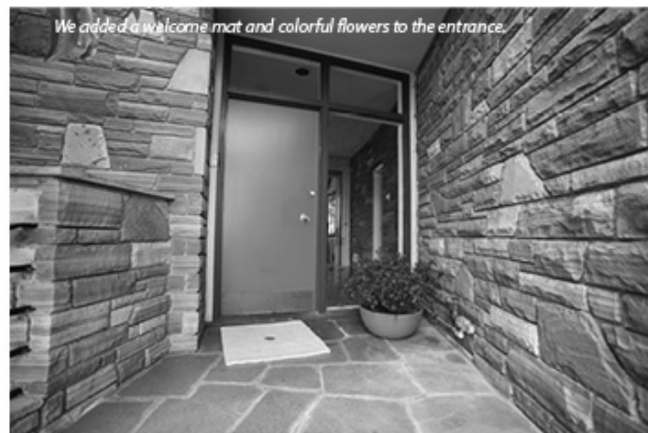
We added a welcome mat and colorful flowers to the entrance.