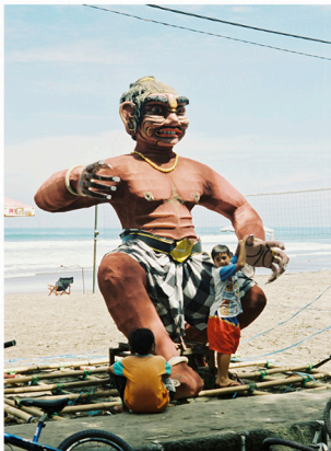
Ogoh-Ogoh statue on the beach