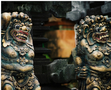
Kumba Karna demon guardians