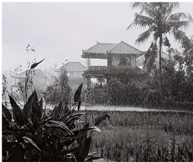
View from my room at Melati Cottages