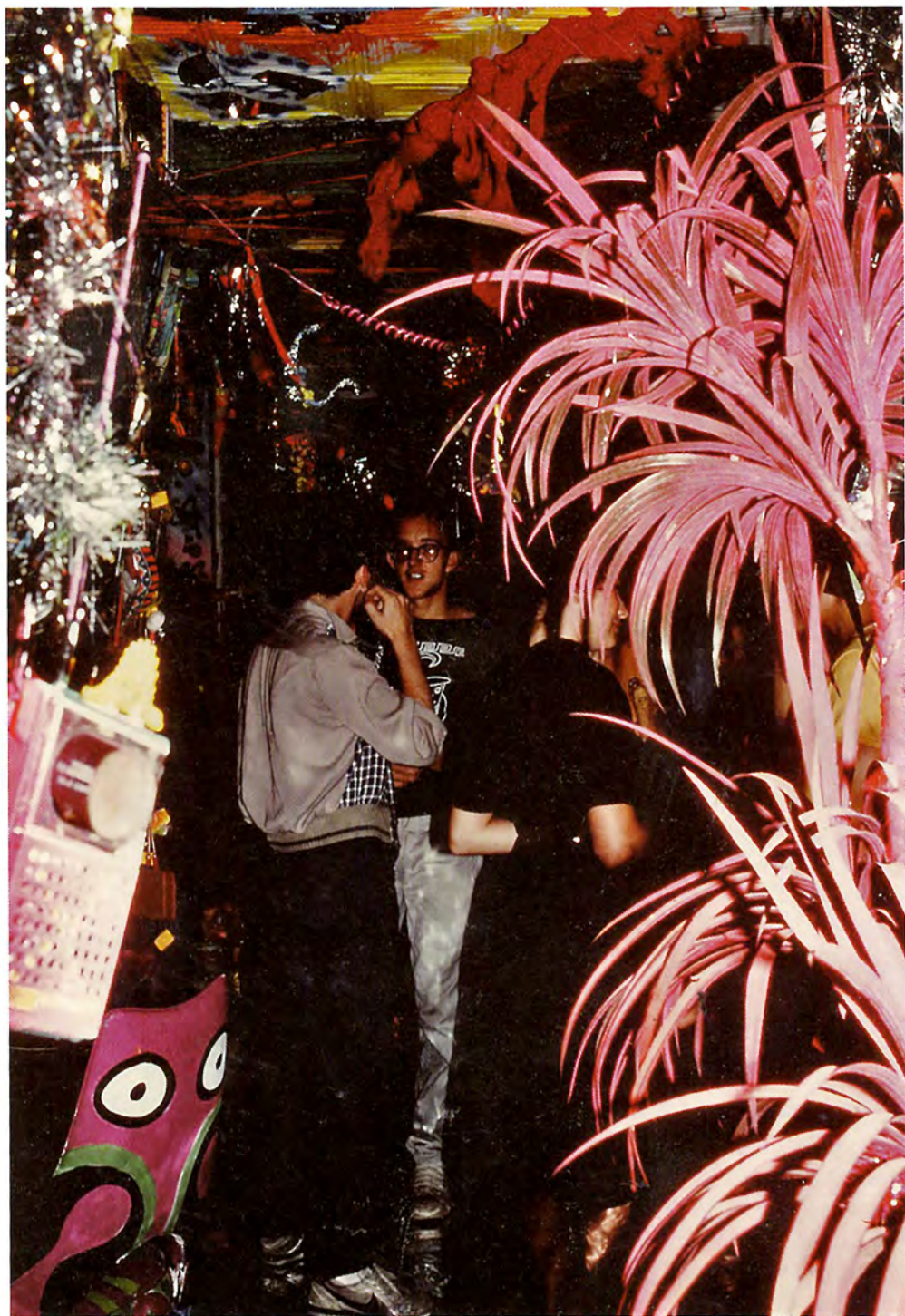
Clubbing at the Kenny Scharf show in the FUN Gallery, New York 1982.