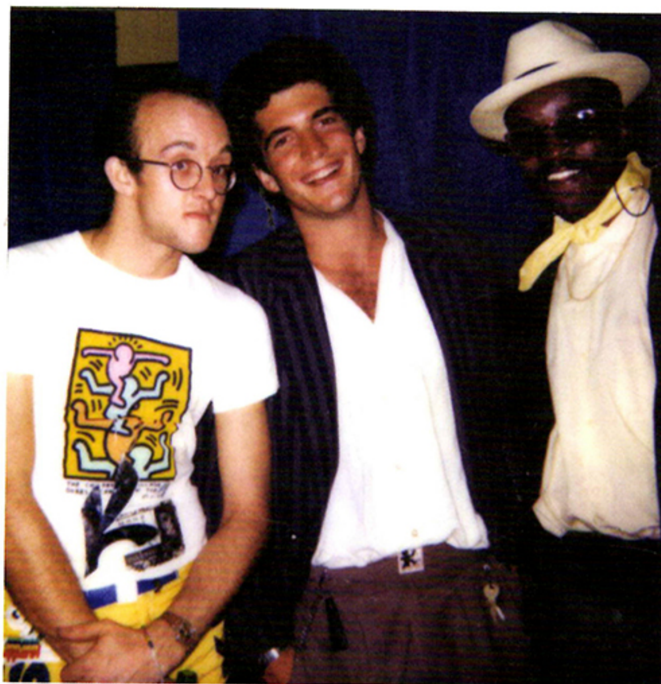
KEITH HARING, JFK - JR, AND FAB 5 FREDDY