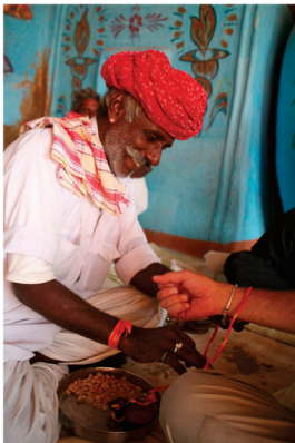
Priest tying red string at Opium Ceremony