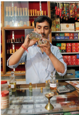
Pouring oils at Shankar Bros in Varanasi