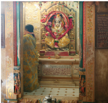
Prayers at the Jain Temple in Mumbai