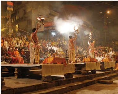
Agni Pooja at Dashashwamedh Ghat