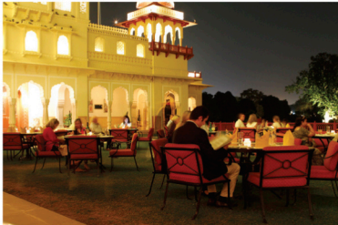
Dinner at Rambagh Palace in Jaipur