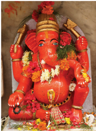
Ganesh Shrine in Mumbai